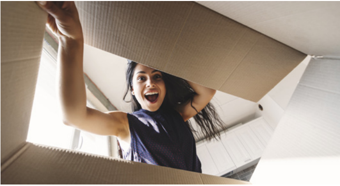
What's In the Box? Free Energy Saving Measures!

To help our income-eligible customers keep their living spaces healthy, comfortable, and energy efficient, Liberty has created Energy Savings Starter Kits that include measures such as advanced power strips and more. Some income-eligible electric customers may also be eligible to claim free air purifiers and dehumidifiers and more!