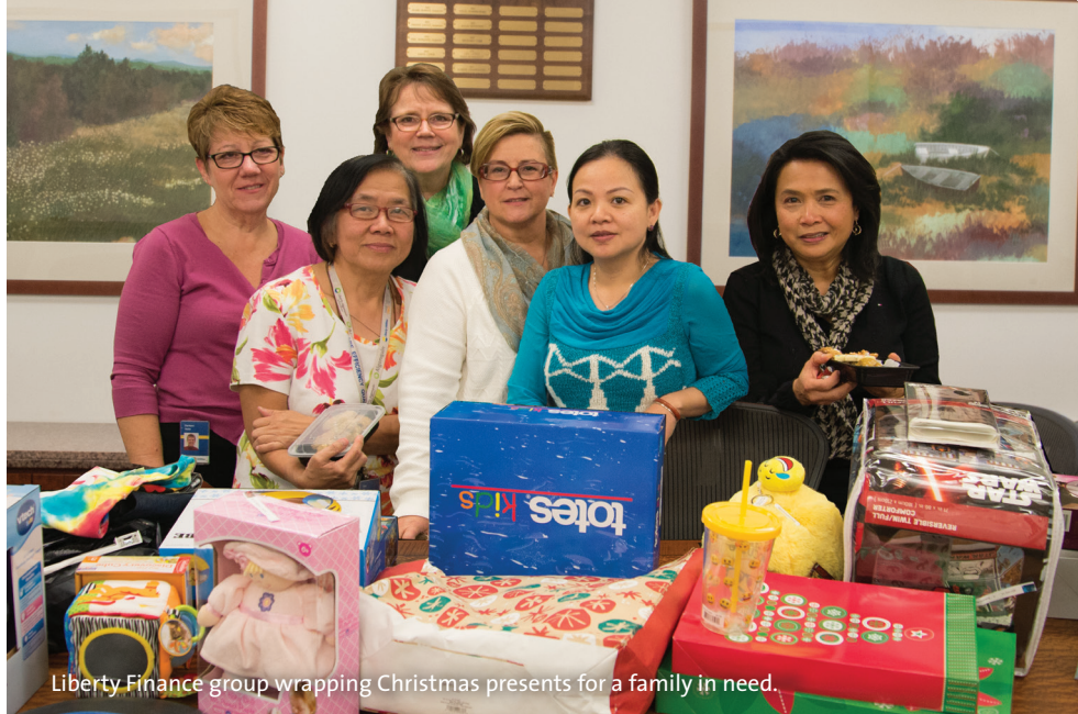
Liberty Finance group wrapping Christmas presents for a family in need.