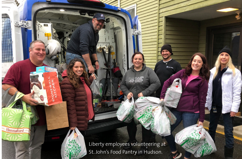
Liberty employees volunteering at St. John's Food Pantry in Hudson.