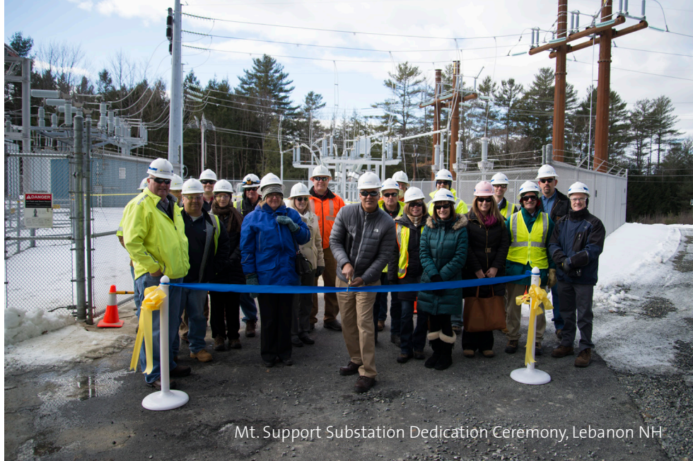
Mt. Support Substation Dedication Ceremony, Lebanon NH